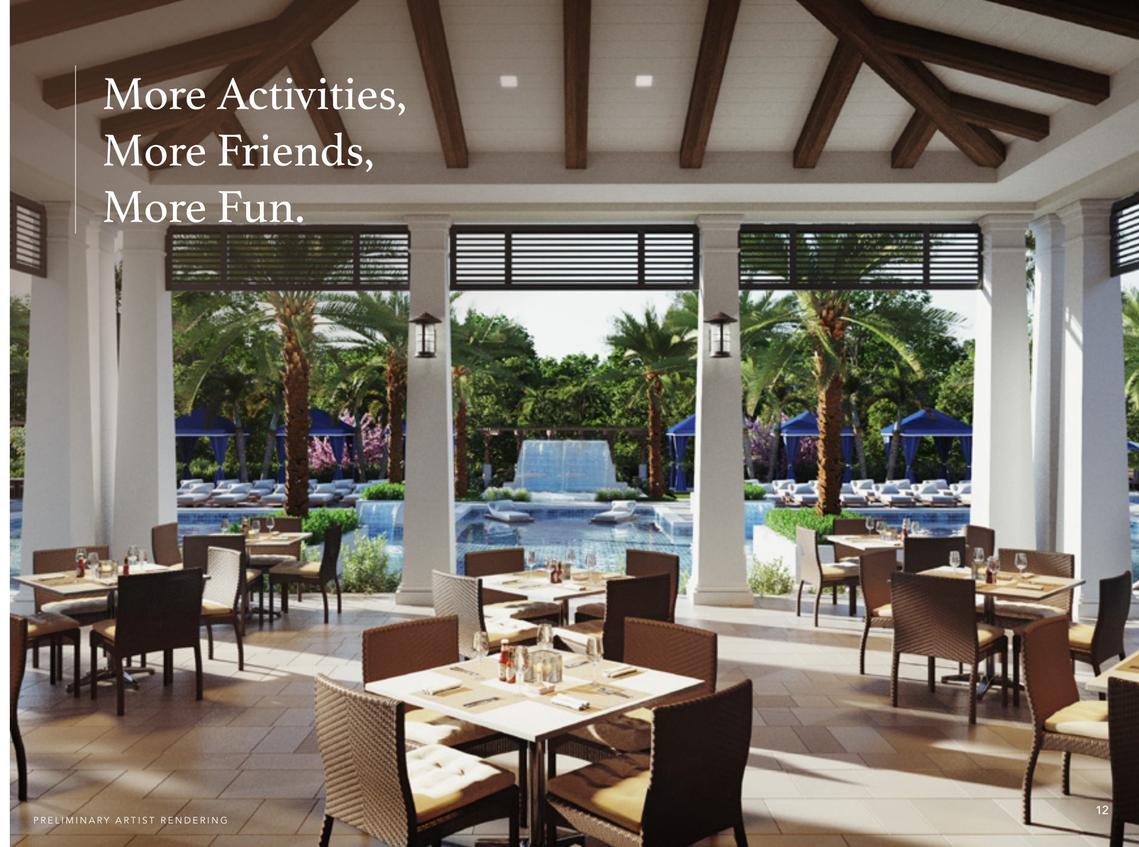
PRELIMINARY ARTIST RENDERING

More Activities, More Friends, More Fun.