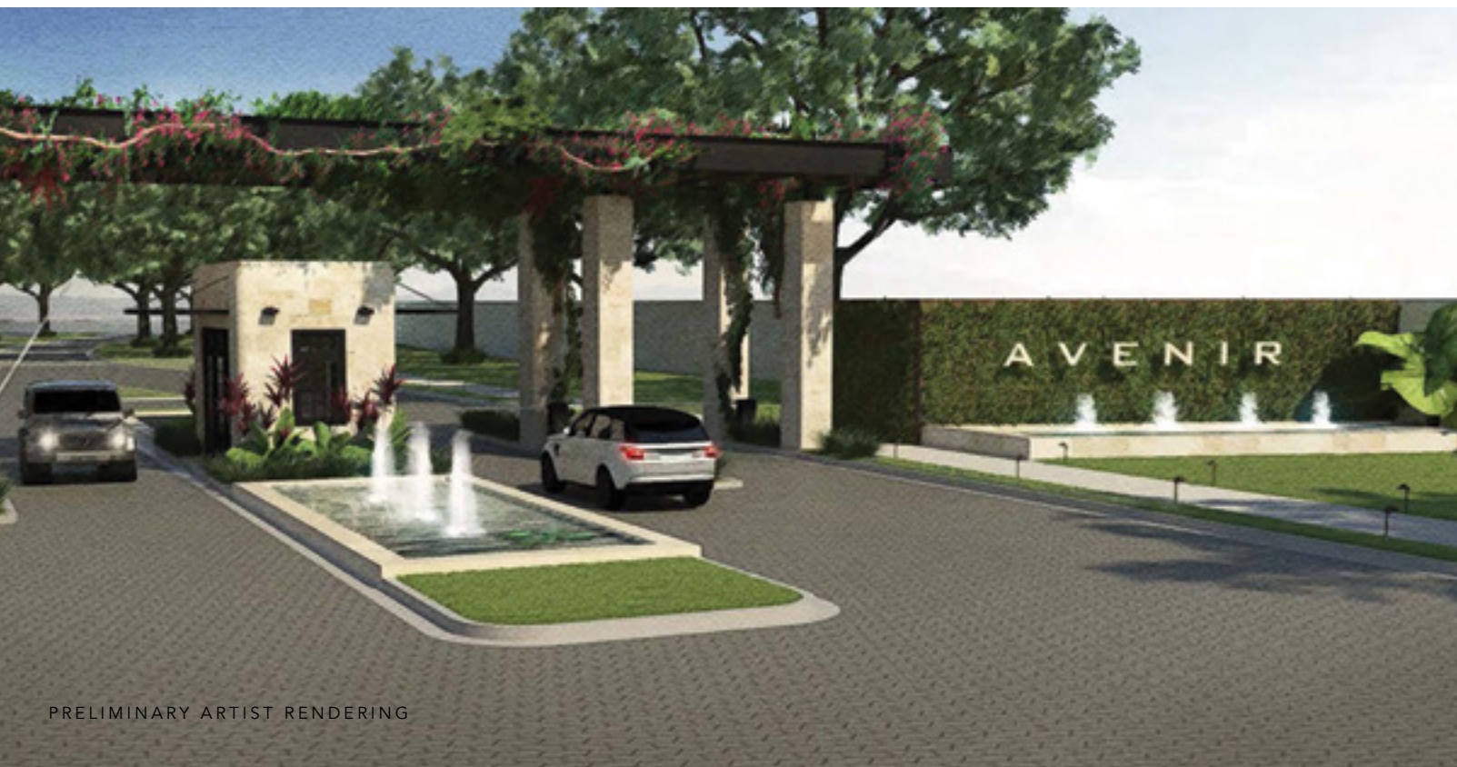
PRELIMINARY ARTIST RENDERING

As the home of the PGA, Palm Beach Gardens occupies a special place in the world of golf. One of the city's most popular public courses is Sandhill Crane Golf Course, located right next door to Avenir. The recently renovated, par-72 course is surrounded by southern pines, palm trees and marshlands, and boasts new irrigation, Celebration Bermuda fairways and TifEagle greens.