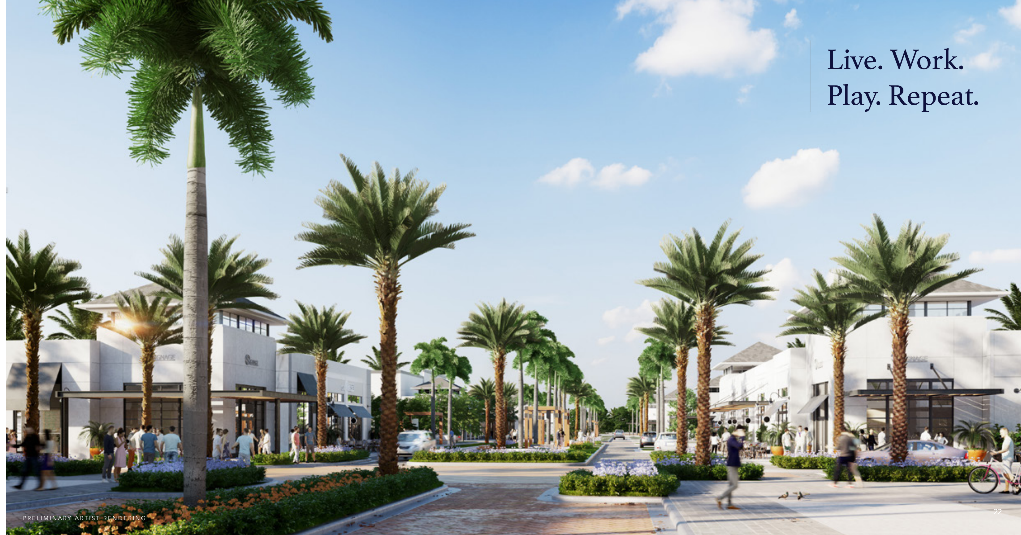
PRELIMINARY ARTIST RENDERING