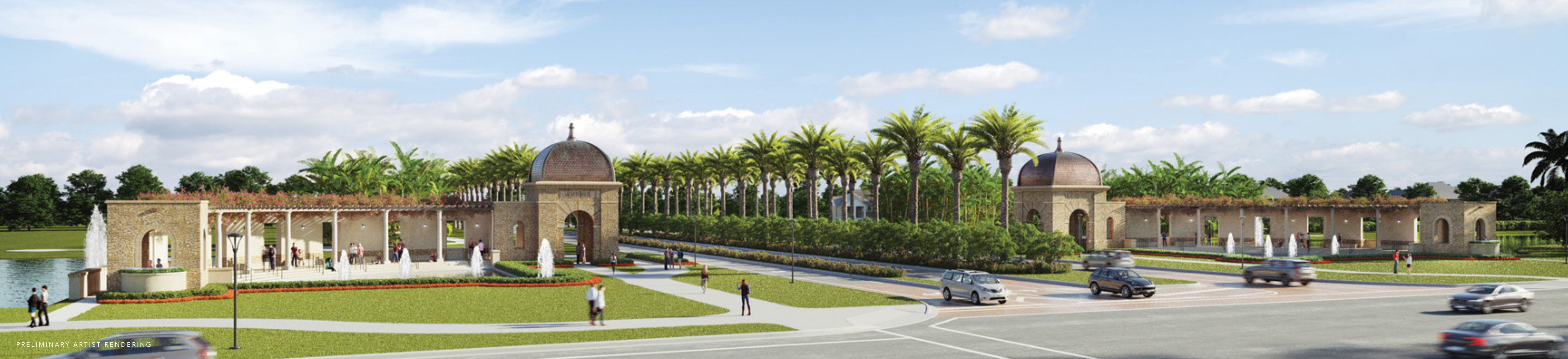
PRELIMINARY ARTIST RENDERING