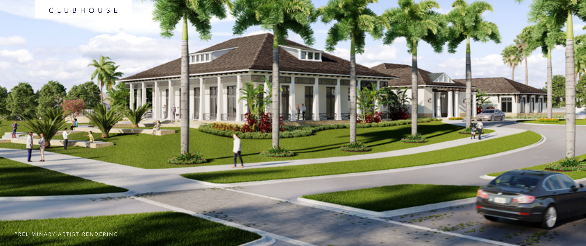
PRELIMINARY ARTIST RENDERING