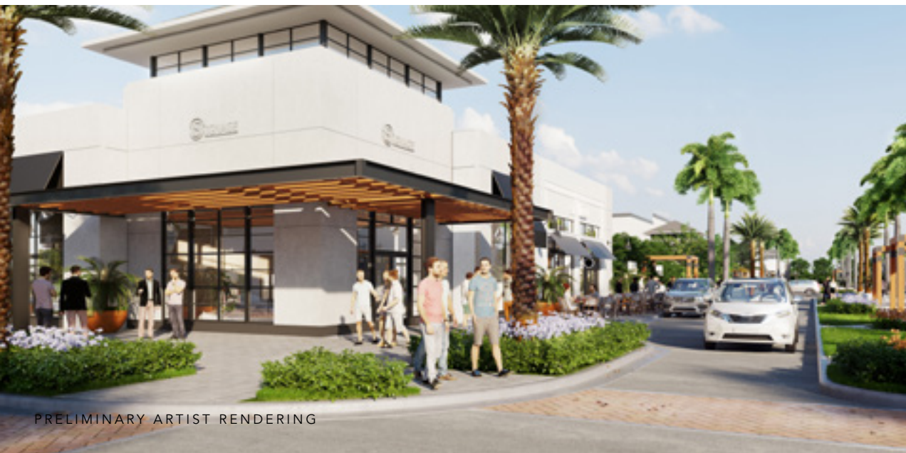
PRELIMINARY ARTIST RENDERING

A key component of Avenir will be our new Town Center, the business heart of Avenir, approved for 400,000 SF of retail space and 2,000,000 SF of offices. Whether you live within Avenir, have an office here or just visit for fun, you will encounter a thriving day-to-night community with retail, dining and entertainment. Enjoy wonderful options from everyone's favorite boutiques and coffee shops to one-of-a-kind offerings all set in a luxurious outdoor environment.