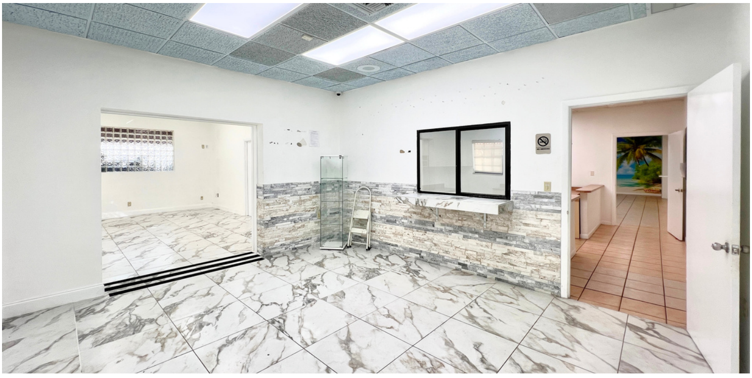
10,446 SF Lot 4,672 SF Total Bldg. Area