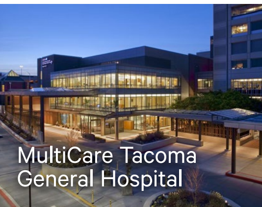
MultiCare Tacoma General Hospital