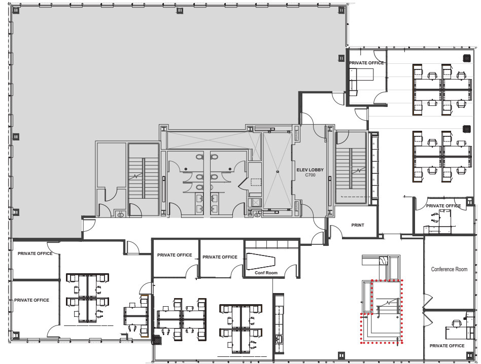
FLOOR 7: 5,939 SF