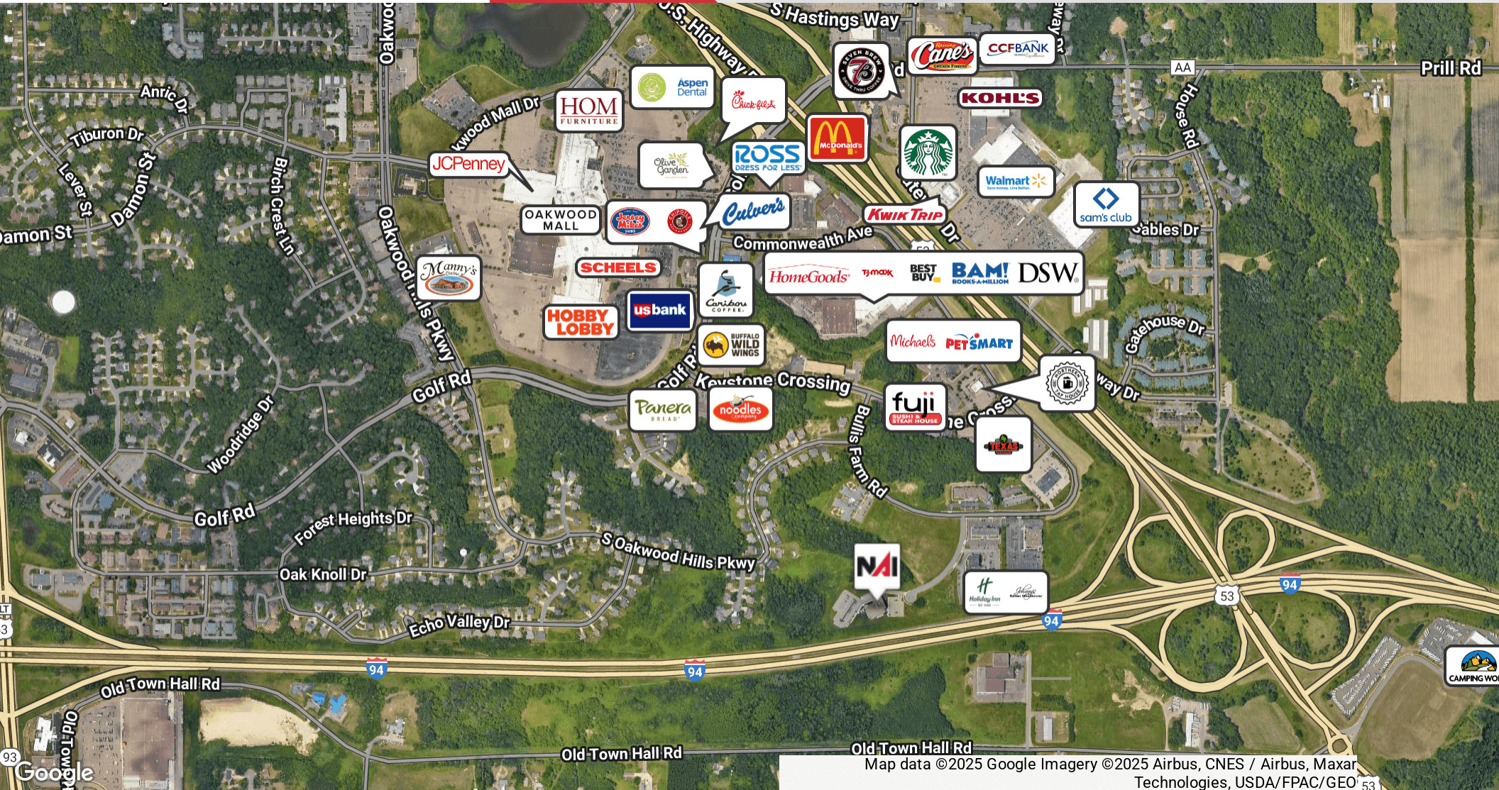
Map data ©2025 Google Imagery ©2025 Airbus, CNES / Airbus, Maxar Technologies, USDA/FPAC/GEO 53

BROCHURE | 4890 Owen Ayres Ct Eau Claire, WI 54701