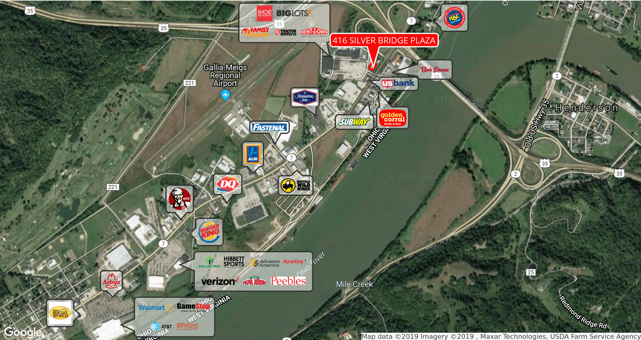
Map data ©2019 Imagery ©2019 , Maxar Technologies, USDA Farm Service Agency

416 Silver Bridge Plaza , Gallipolis, OH 45631