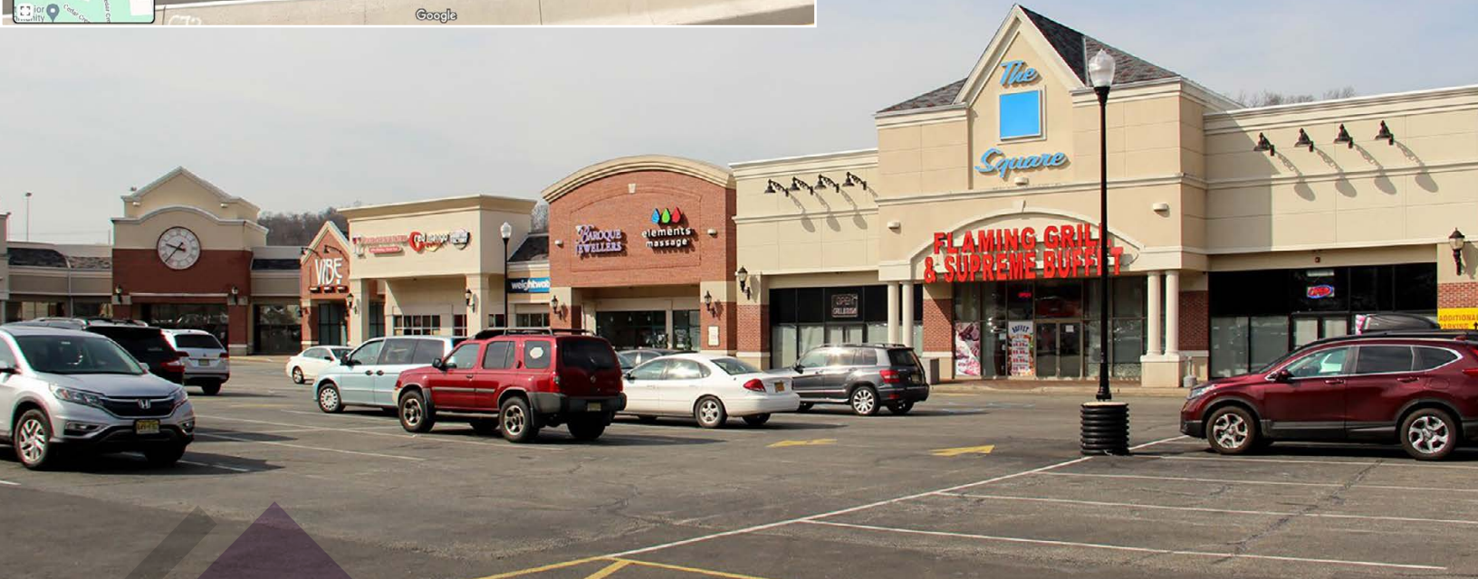
The Square at Riverdale 92 Route 23 Riverdale, NJ 07652