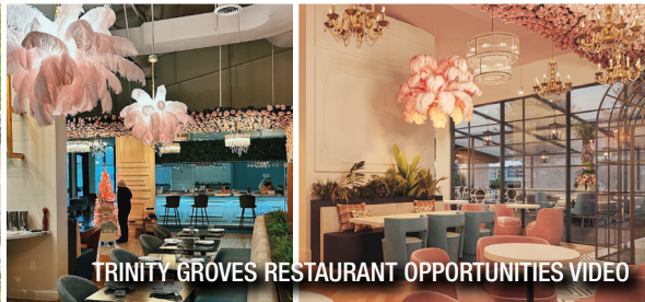
TRINITY GROVES RESTAURANT OPPORTUNITIES VIDEO

AVAILABILITY: 5,000 SF LEASE RATES: PLEASE CALL FOR INFO.