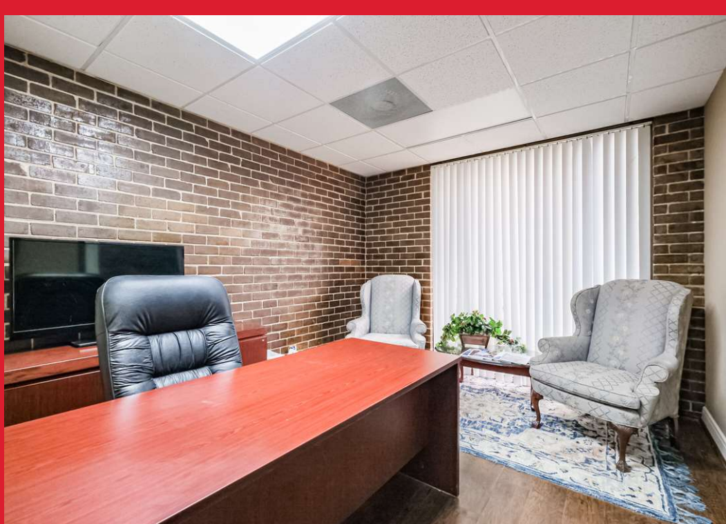
Lobby and Several Offices