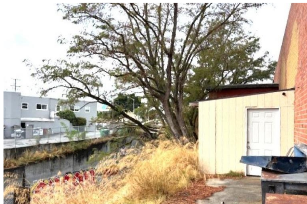
Creekside of Property