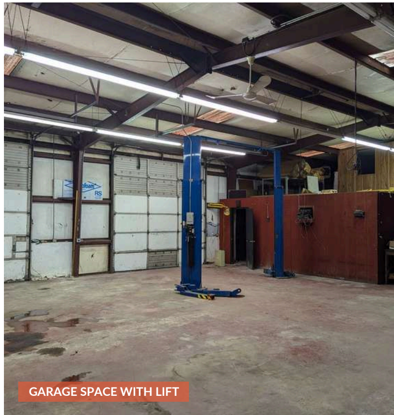
GARAGE SPACE WITH LIFT