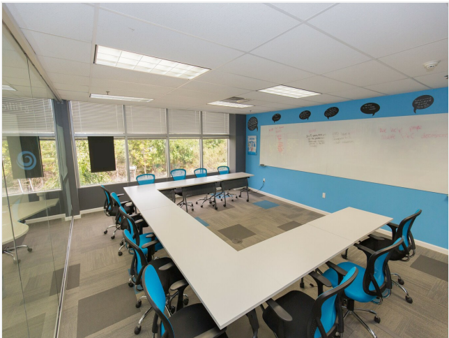
Glass Conference room