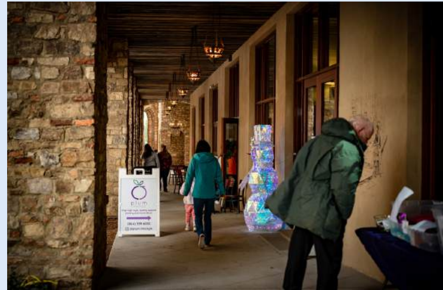
Bridge Mary Station Christmas Celebration