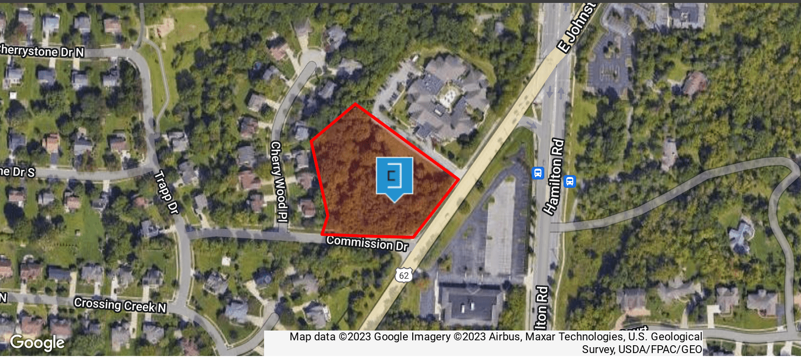
Map data ©2023 Google Imagery ©2023 Airbus, Maxar Technologies, U.S. Geological Survey, USDA/FPAC/GEO