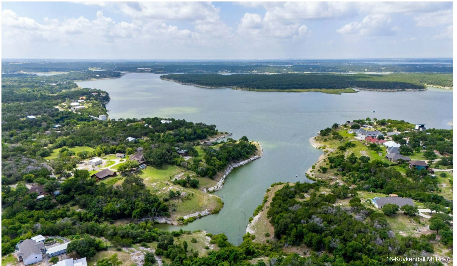
16-Kuykendall Mt Rd-7