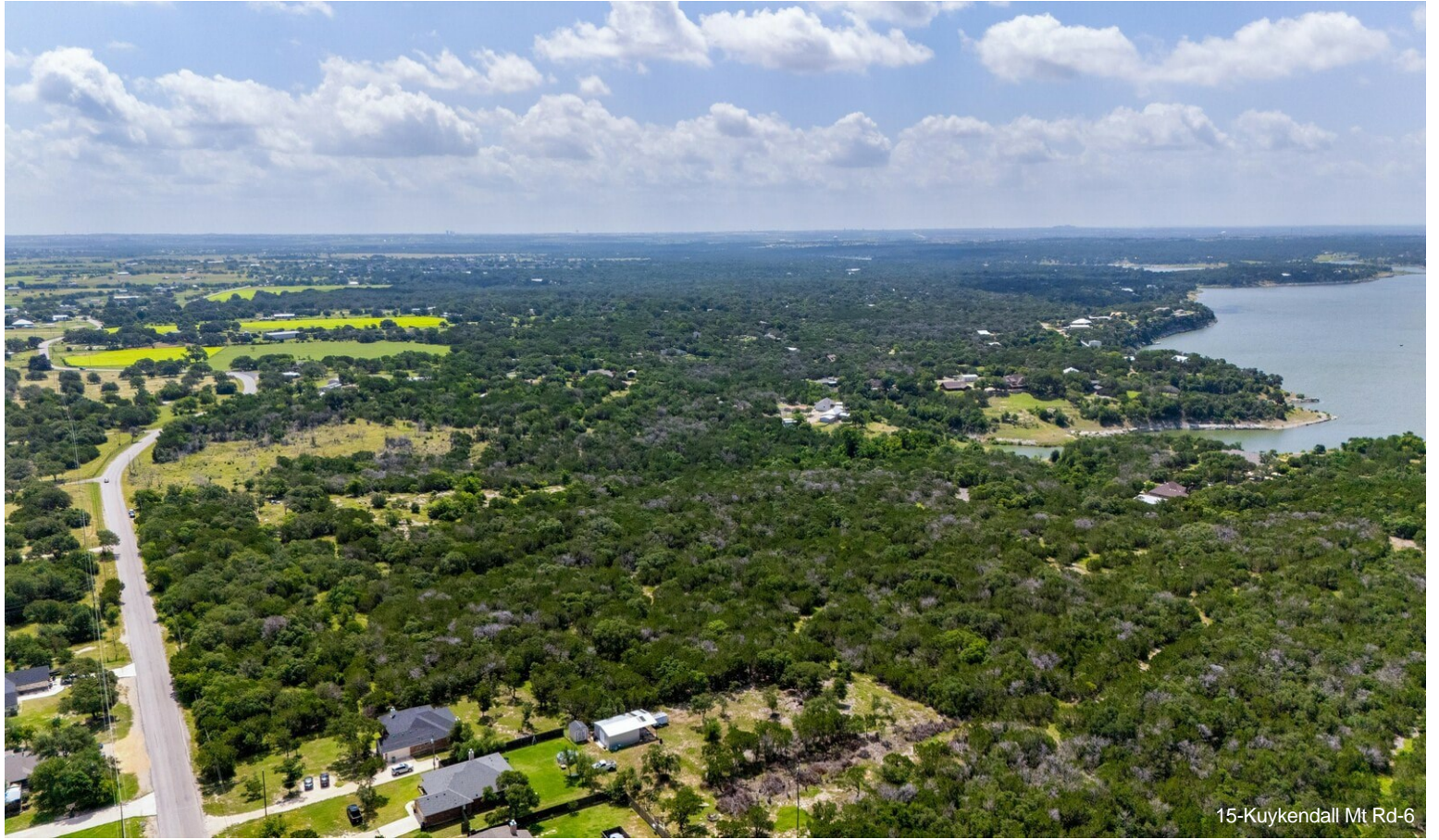
15-Kuykendall Mt Rd-6