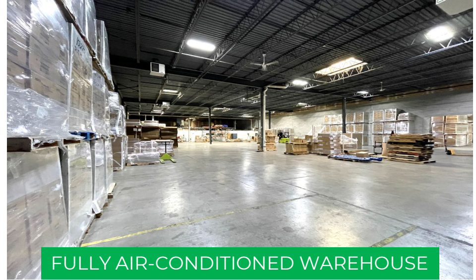
FULLY AIR-CONDITIONED WAREHOUSE