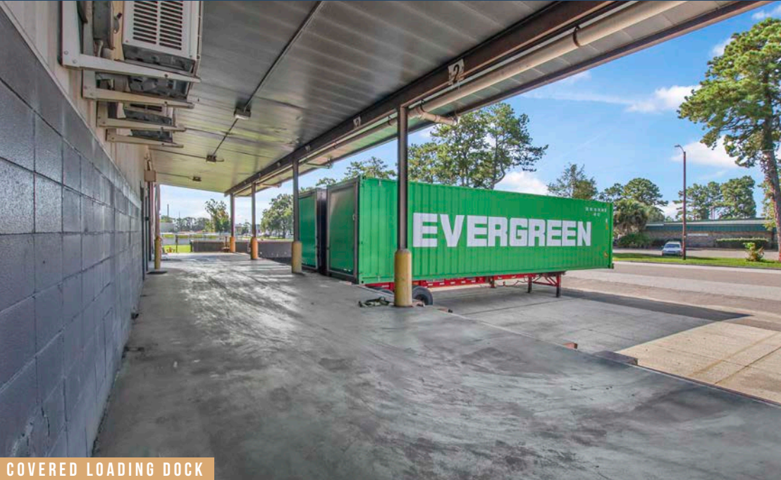
COVERED LOADING DOCK