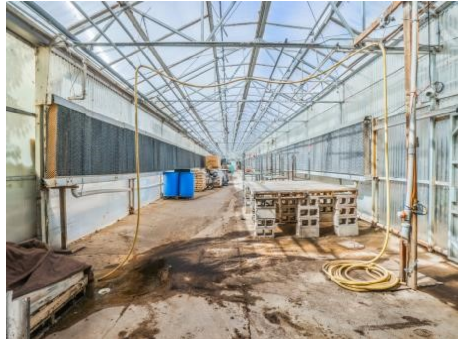
BAE, LLC 900 N. Taft Hill Avenue, Fort Collins, CO 80521