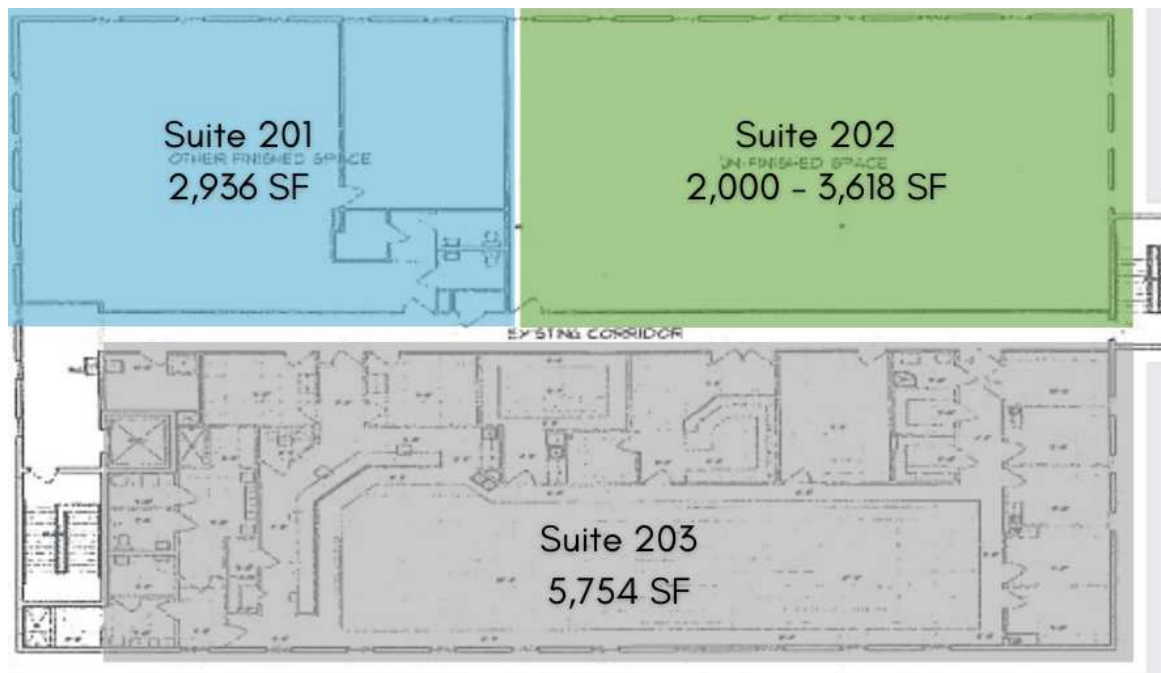
Second Floor Layout

PRESENTED BY ASHLEY WALKER 407.430.3462 awalker@millenia-partners.com