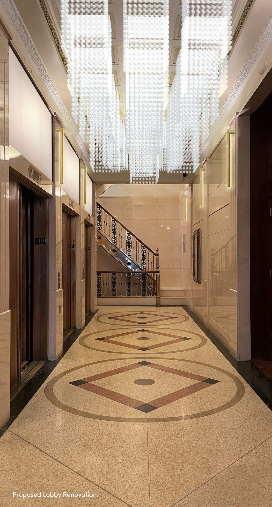
Proposed Lobby Renovation