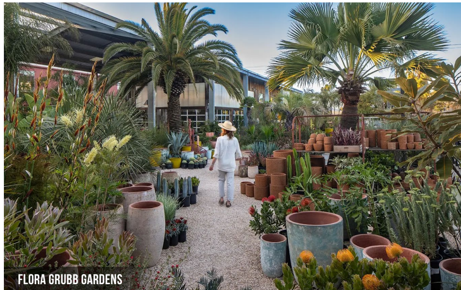
FLORA GRUBB GARDENS