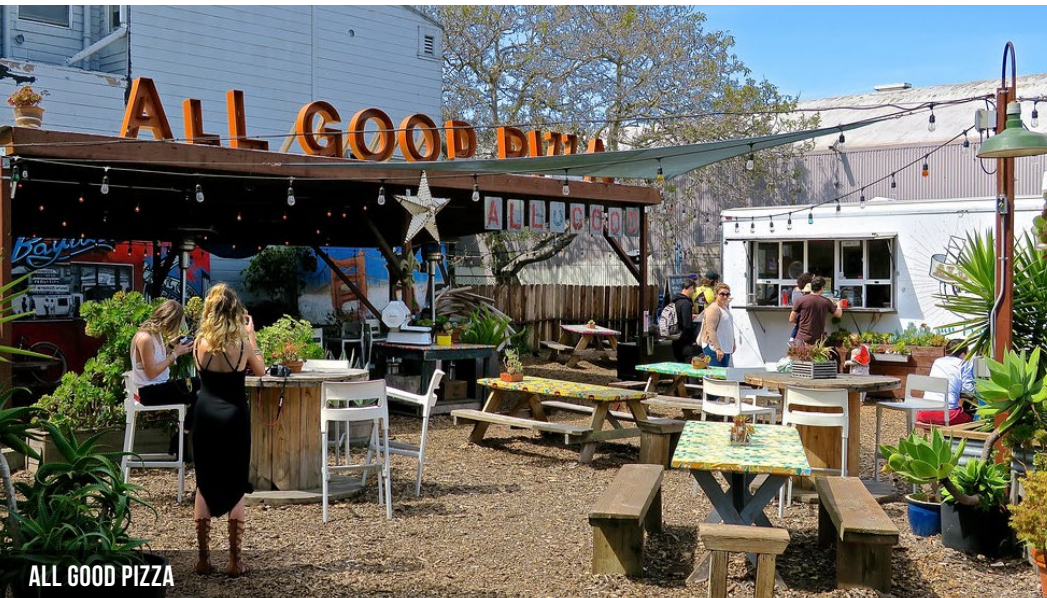
ALL GOOD PIZZA