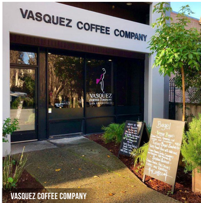
VASQUEZ COFFEE COMPANY