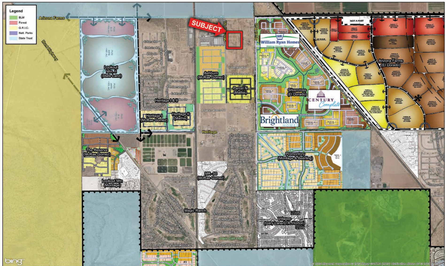
Magic Ranch Area Developments