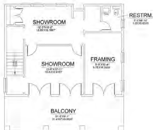
Floor Plan: 545 S. Foster Dr.