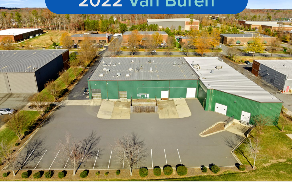
2022 Van Buren