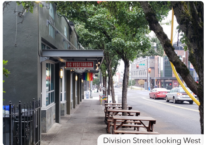
Division Street looking West