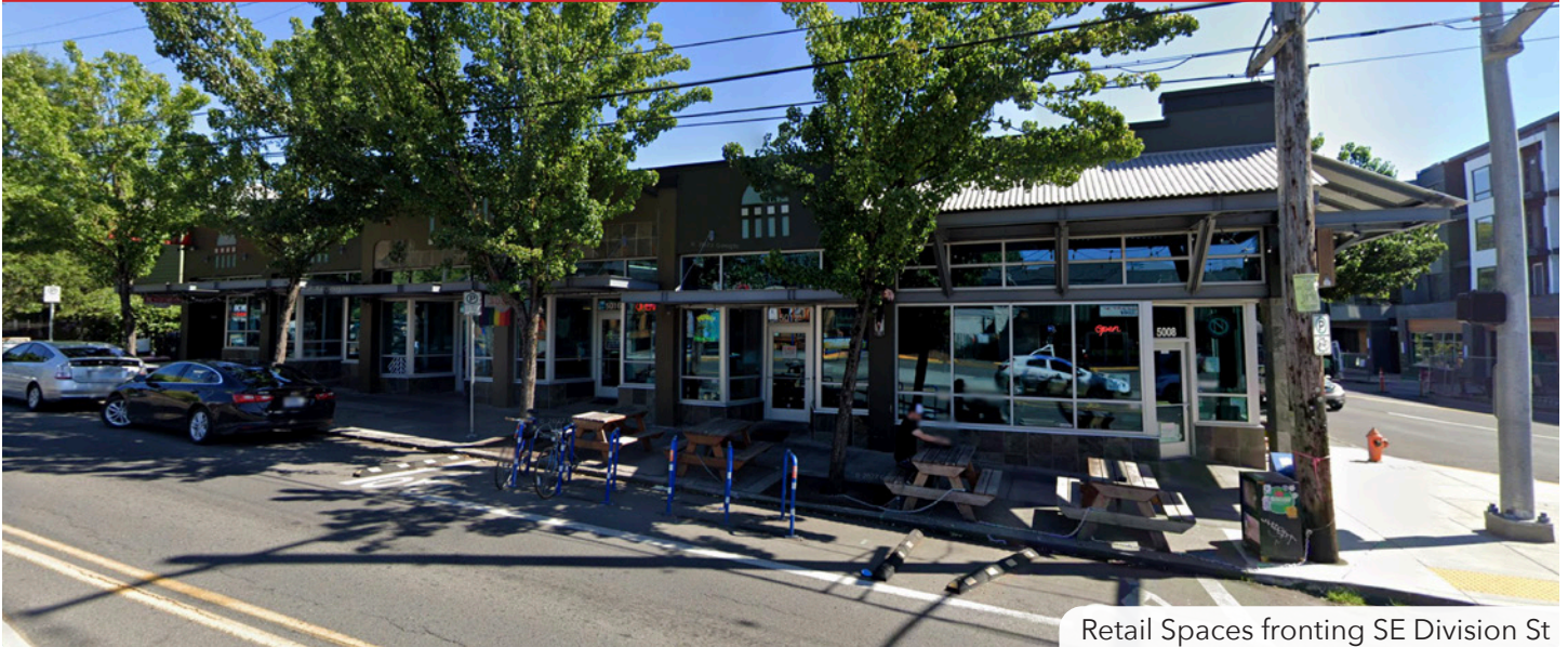
Retail Spaces fronting SE Division St