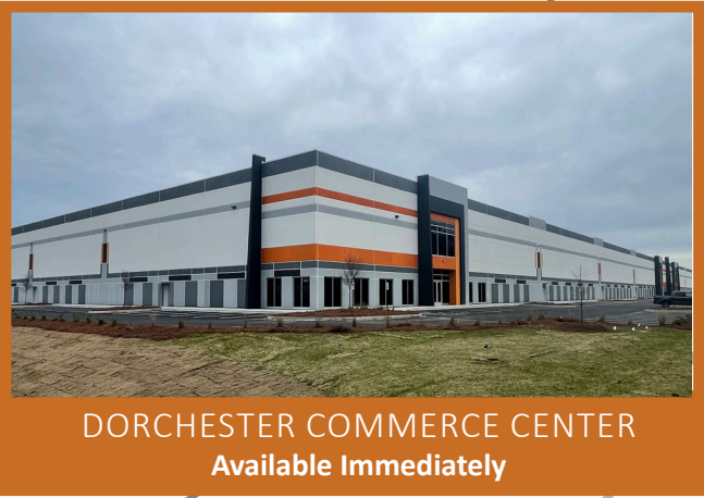
DORCHESTER COMMERCE CENTER Available Immediately