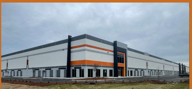
DORCHESTER COMMERCE CENTER Available Immediately