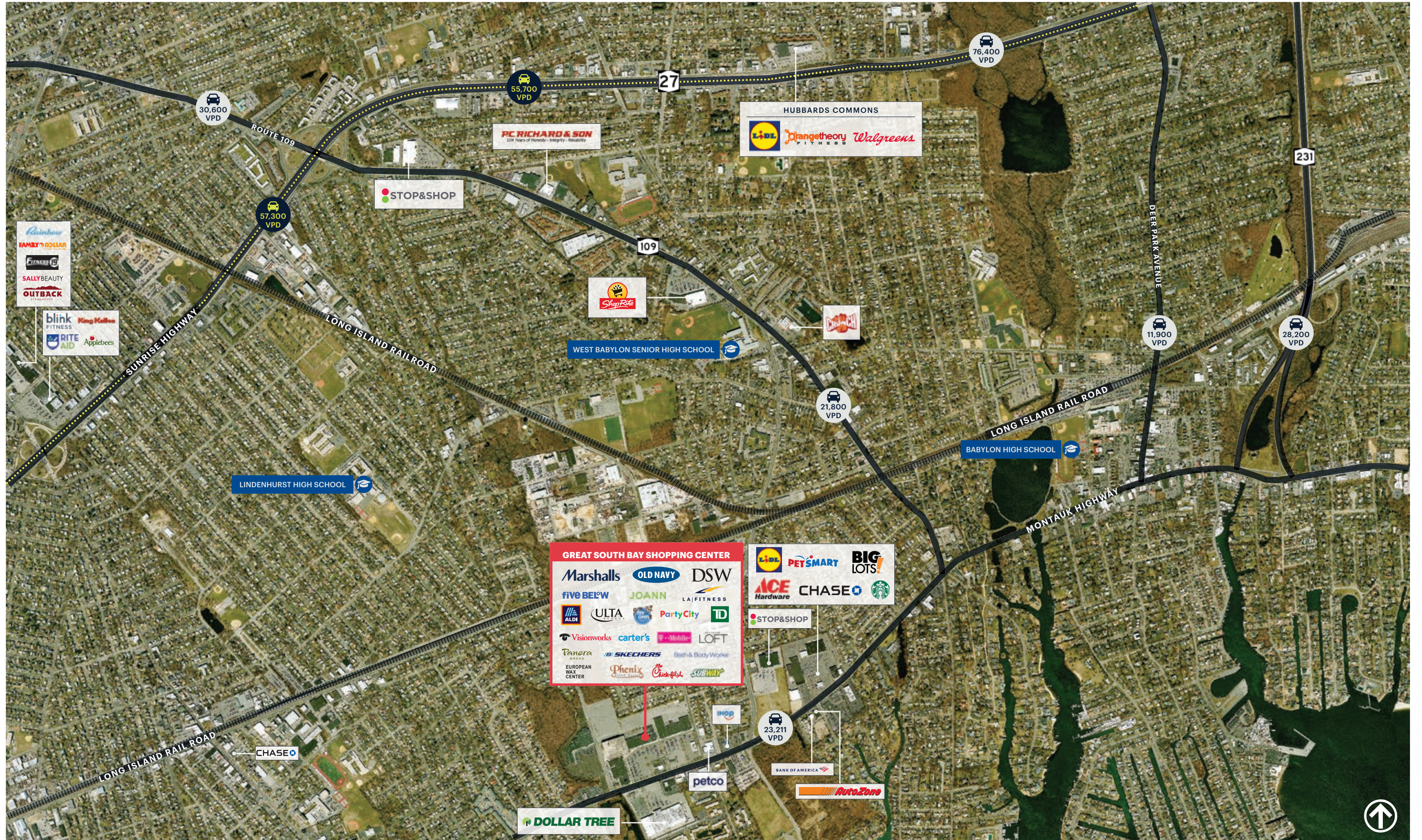
GREAT SOUTH BAY SHOPPING CENTER WEST BABYLON, NEW YORK