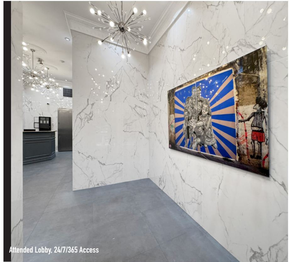
Attended Lobby, 24/7/365 Access