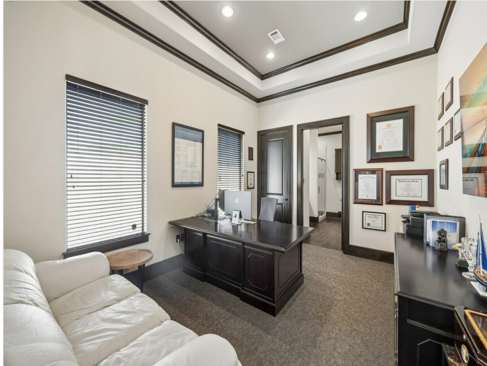
Executive office with private bathroom