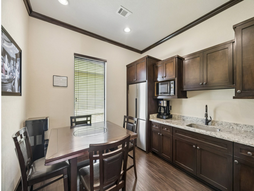
Breakroom with sitting area