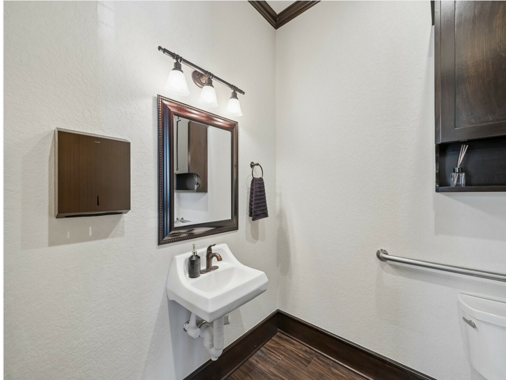
One of 3 ADA compliant bathrooms