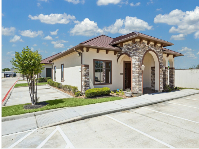
6 assigned parking spots in front