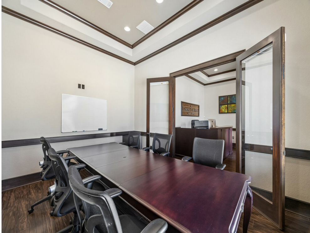
Conference room with 6 person table conveys