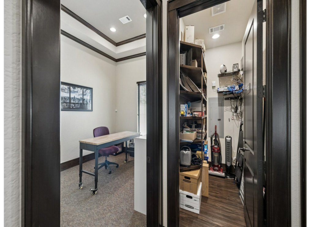
Ample storage/IT closet