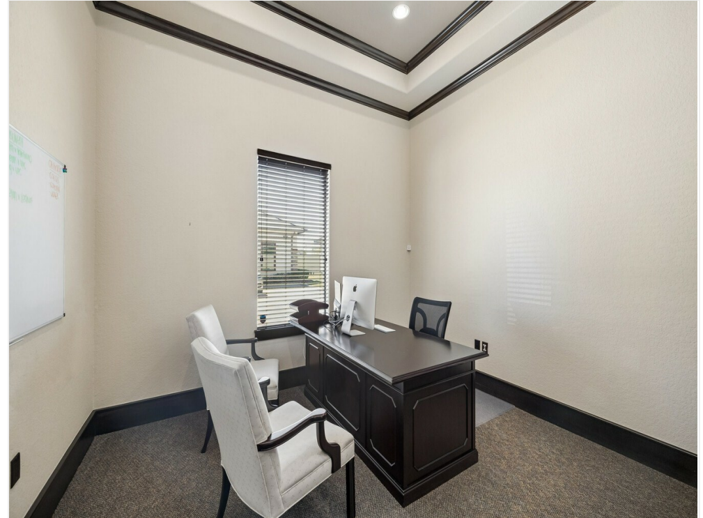
Furniture in all offices conveys