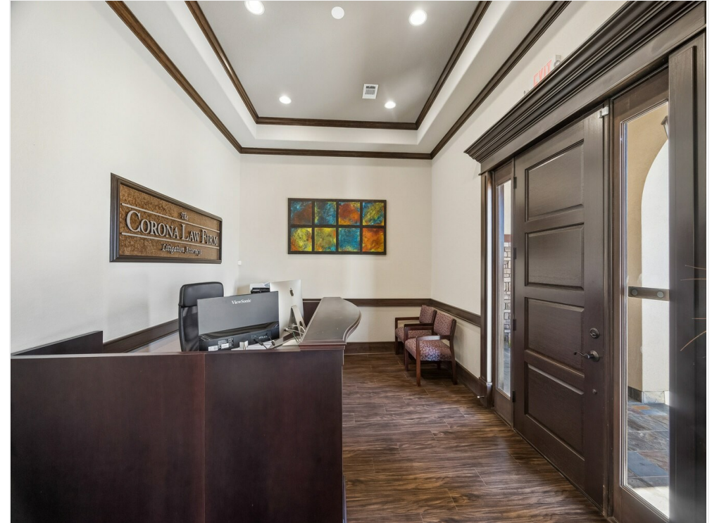
All furniture conveys