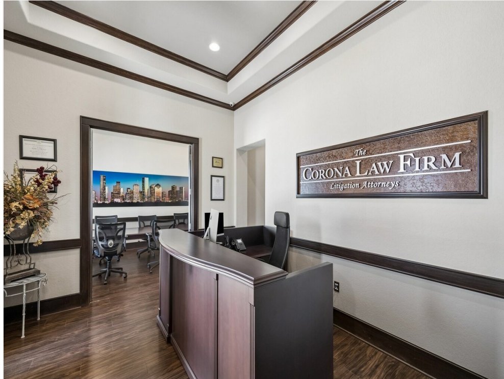
Beautifully appointed reception area