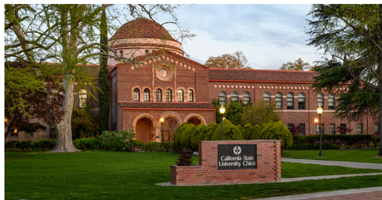
Pictured: CSU Chico, Bidwell Park, Sierra Nevada Brewery