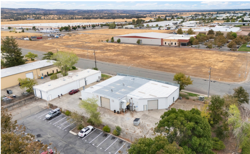
Chico Airport Business Industrial Park