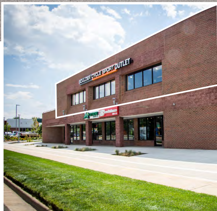
TABLE MESA SHOPPING CENTER