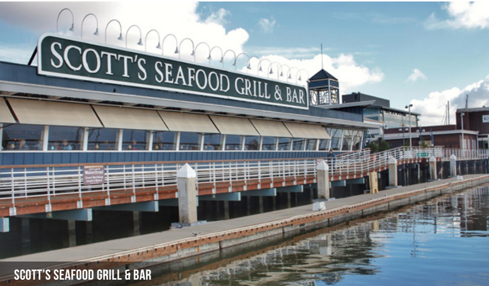
SCOTT'S SEAFOOD GRILL & BAR