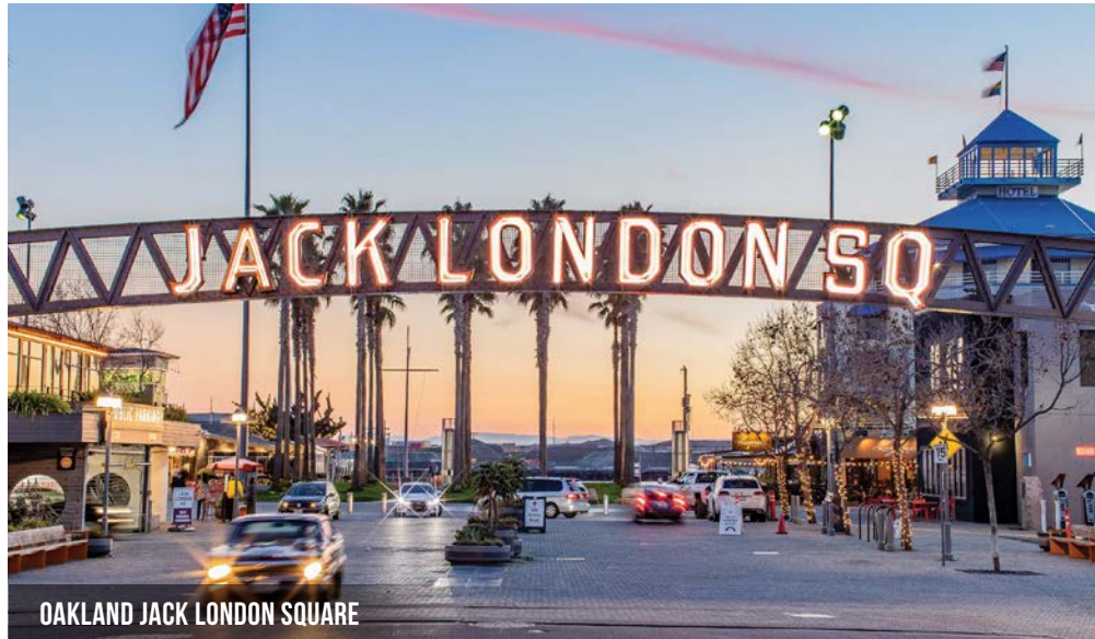
OAKLAND JACK LONDON SQUARE