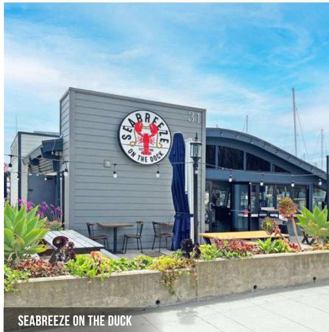
SEABREEZE ON THE DUCK