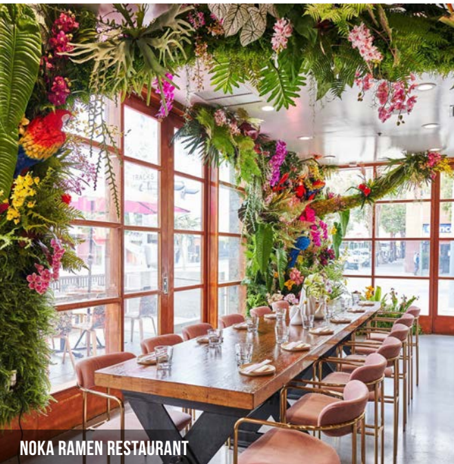
NOKA RAMEN RESTAURANT