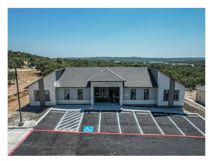
Newly Constructed Building 3