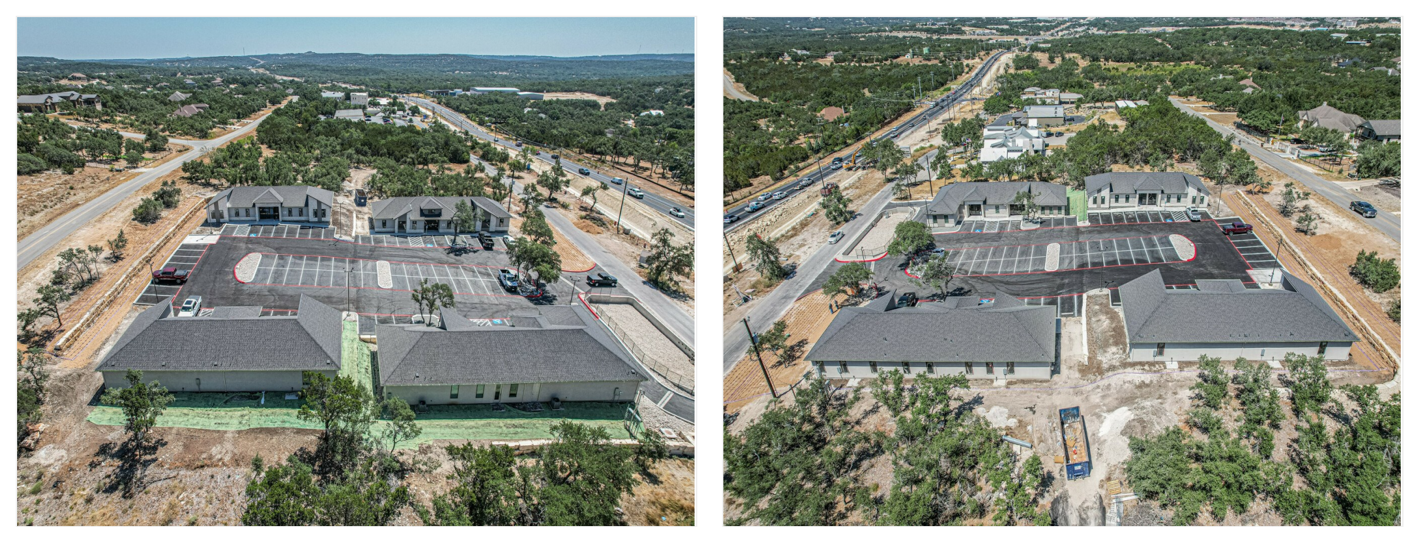
Easily Accessible from Hwy 281