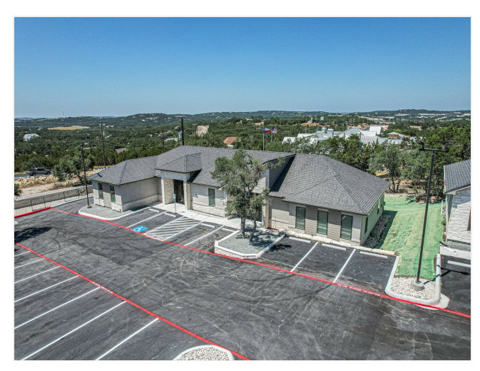
Front of Building 4