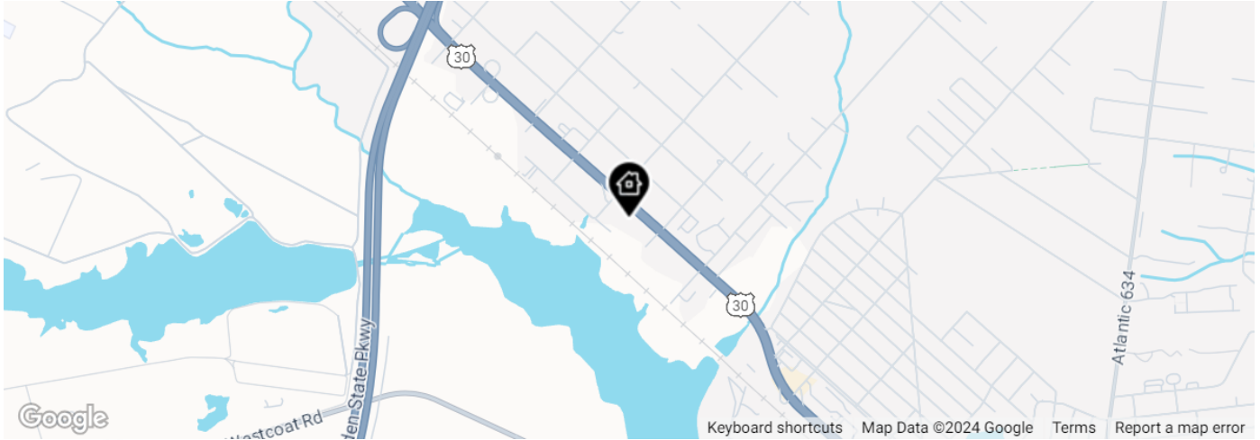
Legend: Subject Property