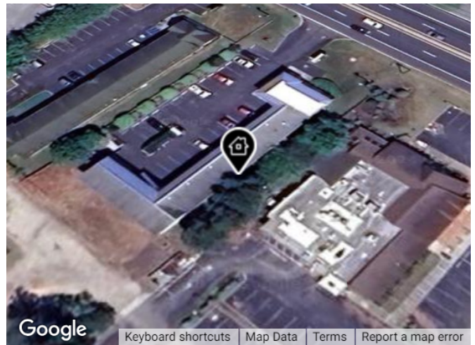
Legend: Subject Property