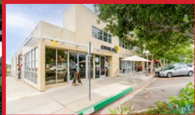
138-140 W SIERRA MADRE BLVD