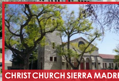
CHRIST CHURCH SIERRA MADRE