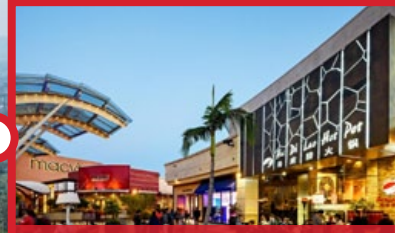
THE SHOPS AT SANTA ANITA