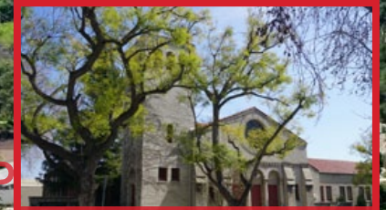
CHRIST CHURCH SIERRA MADRE