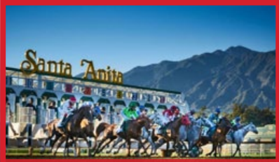
SANTA ANITA PARK