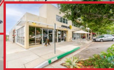
138-140 W SIERRA MADRE BLVD