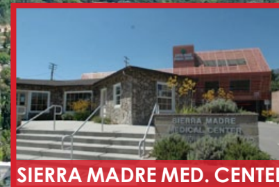
SIERRA MADRE MED. CENTER