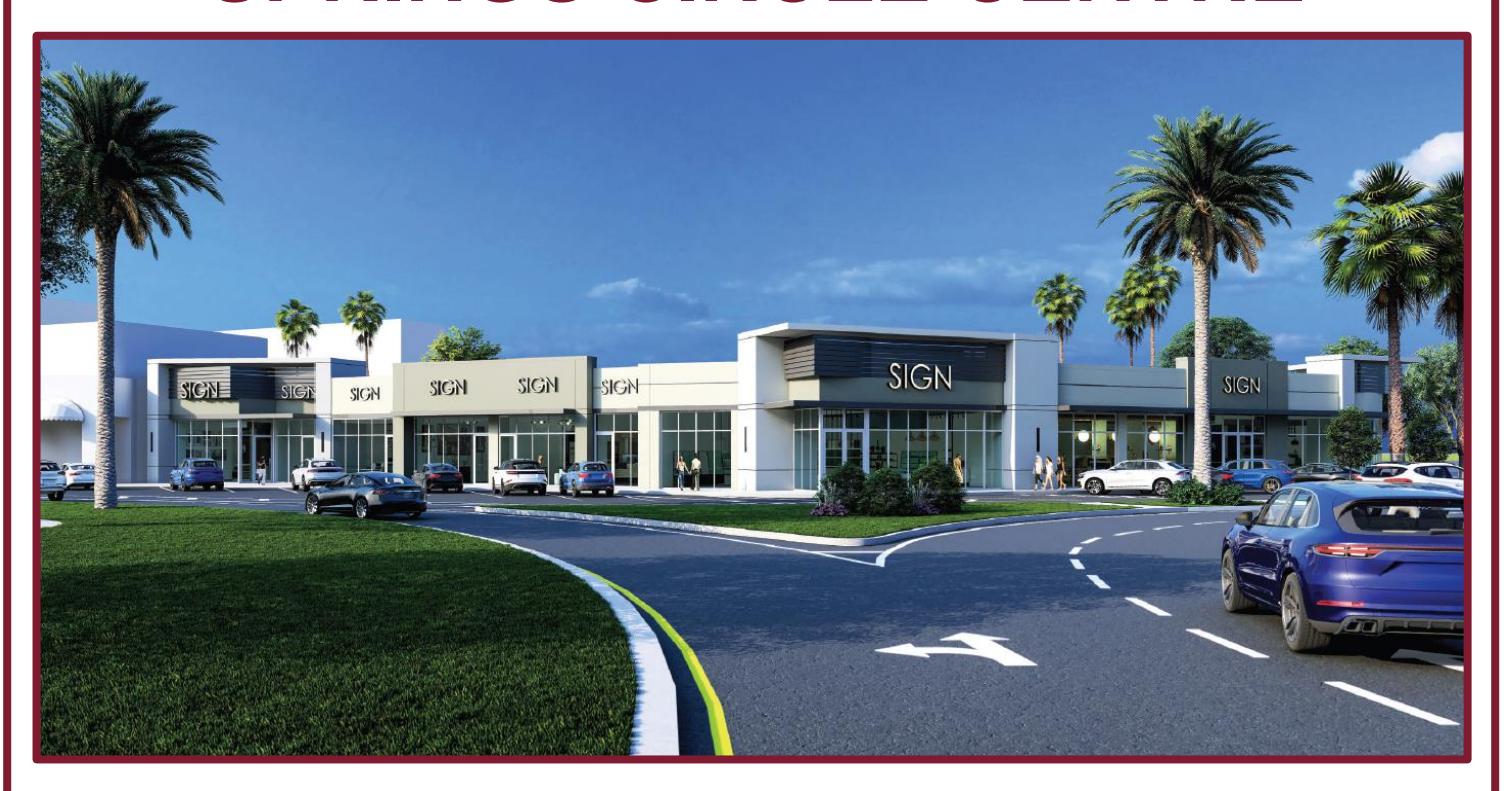
1 S. Royal Poinciana Blvd., Miami Springs, FL @ The Miami Springs Circle