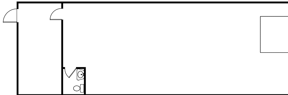
TYPICAL SUITE FLOOR PLAN