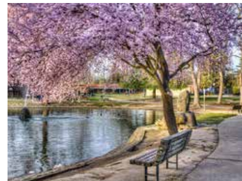
MCKINLEY PARK POND