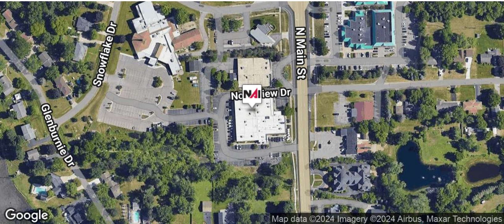
Map data ©2024 Imagery ©2024 Airbus, Maxar Technologies