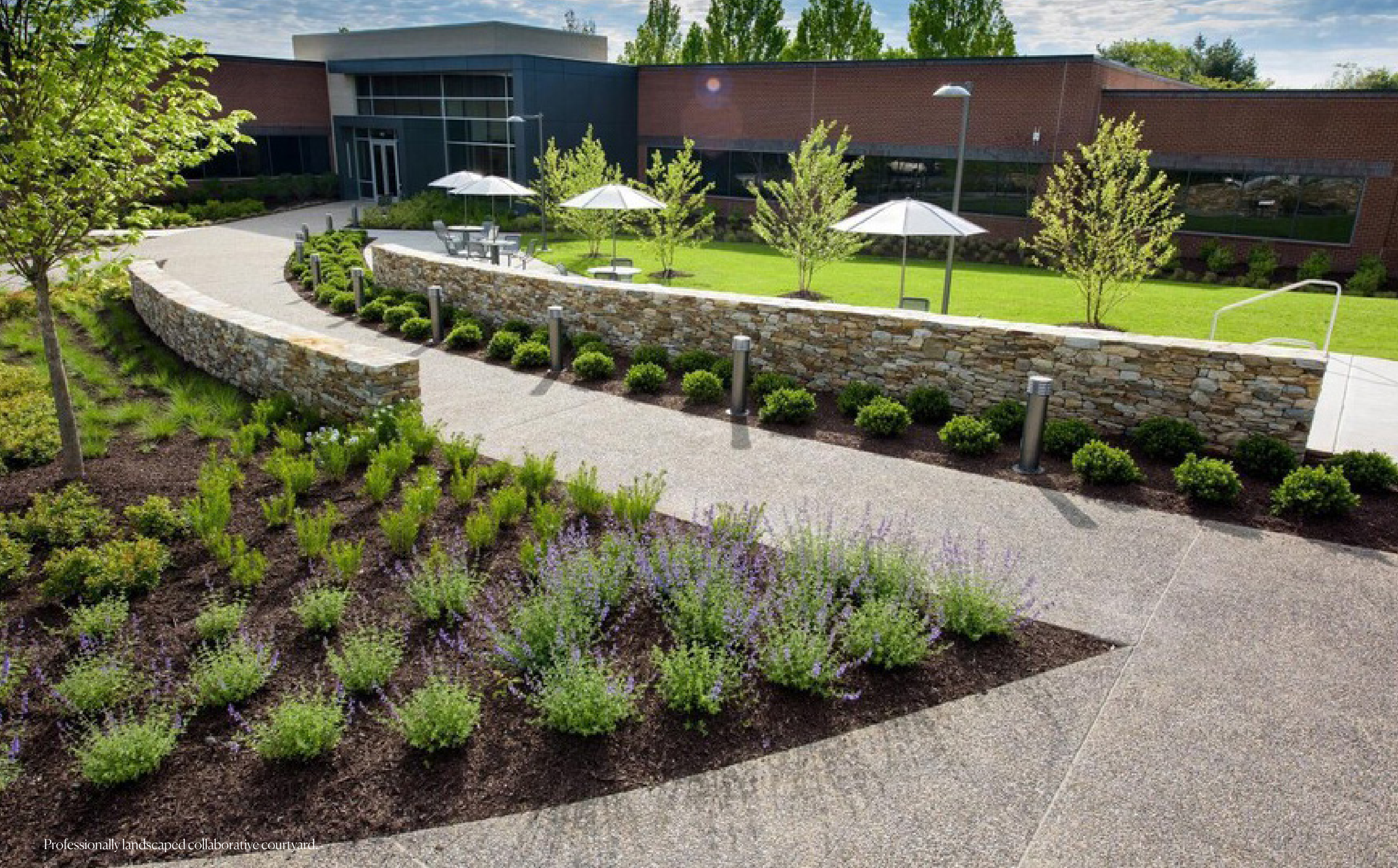
Professionally landscaped collaborative courtyard.