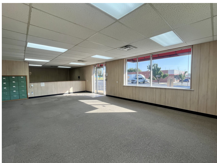
RETAIL / RECEPTION AREA