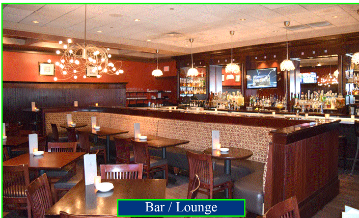
Bar / Lounge