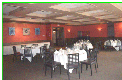
“The Meritage Room”

Sky Restaurant & Function Facility opened in June of 2002 after an extensive renovation of the entire restaurant. All aspects of the renovations were performed by artisans and craftsmen to create a feeling of sophisticated elegance with tones of reds and solid mahogany. Additional renovations were completed in 2015. There are two function rooms, a lounge and a main dining room. The main dining room features the heart and soul of the restaurant with one of the largest indoor waterfalls in the area!