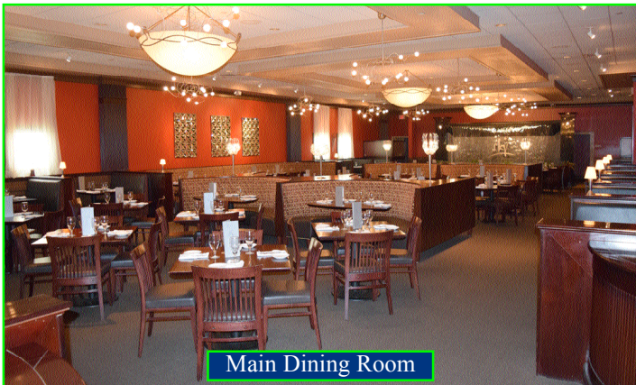
Main Dining Room

Northeast Commercial, Inc. is proud to introduce to you an extraordinary opportunity to purchase the highly acclaimed 447 seat Sky Restaurant & Function Facility in Norwood Massachusetts. This premier state-of-the art 5-Star restaurant is being offered on a “Turn-Key” basis including the business, the goodwill, all furnishings, kitchen appliances, equipment, 3.3 acres of land and a full liquor and entertainment license.