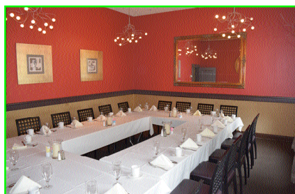
“The Board Room”