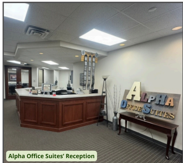
Alpha Office Suites' Reception