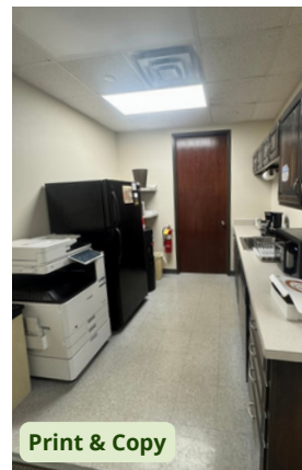
Print & Copy