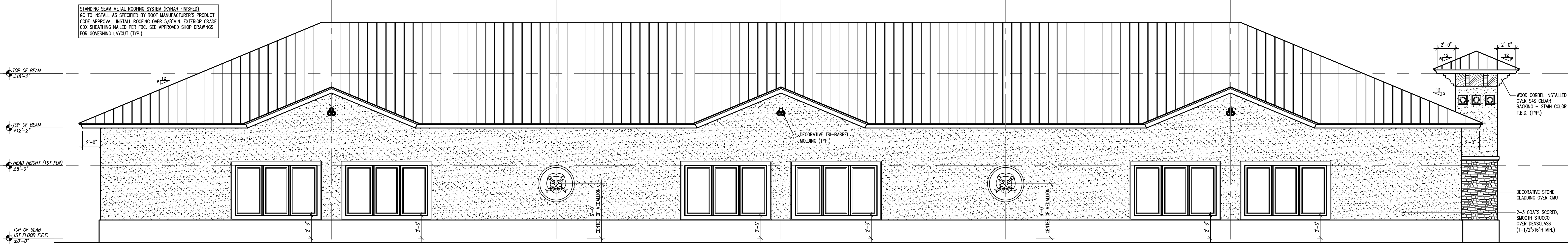
PROPOSED REAR ELEVATION | EAST SCALE: 1/4" = 1'-0"