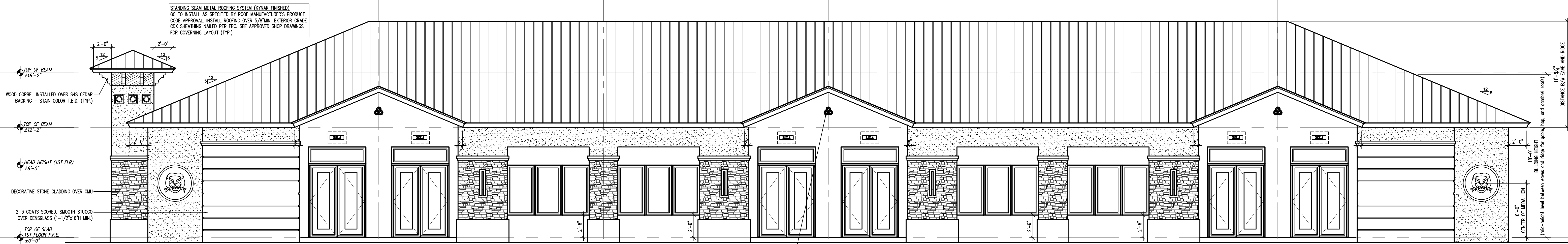
PROPOSED FRONT ELEVATION | WEST SCALE: 1/4" = 1'-0"

SANTA CATALINA Parcel#: 18-42-44-22-62-003-0020 & 18-42-44-22-62-016-0000 3145 & 3197 s Jog Road, Greenacres, FL 33467 Palm Beach County