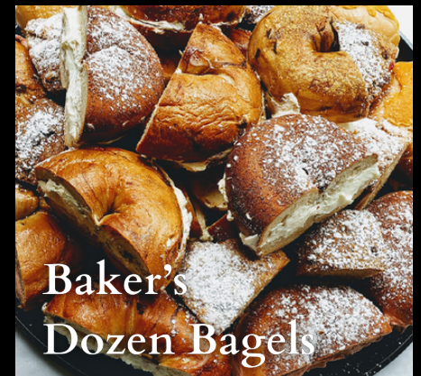
Baker's Dozen Bagels