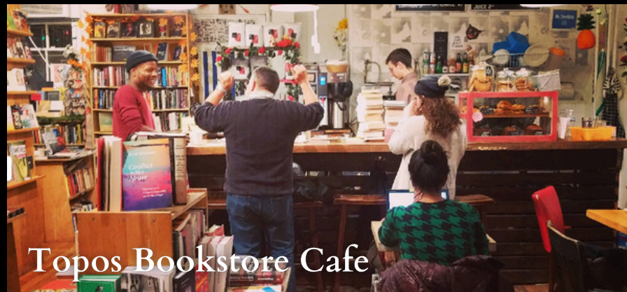
Topos Bookstore Cafe