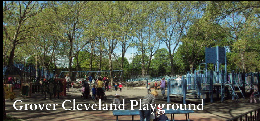
Grover Cleveland Playground

Welcome to Ridgewood, a vibrant neighborhood where historic charm meets modern creativity on the border of Brooklyn and Queens. Discover a community rich in character, with tree-lined streets, classic row houses, and a dynamic arts and café scene. From its deep-rooted history to its thriving local culture, Ridgewood offers a unique blend of old New York soul and contemporary energy—perfect for those seeking an authentic yet evolving urban lifestyle.