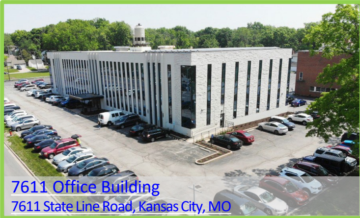
7611 Office Building 7611 State Line Road, Kansas City, MO