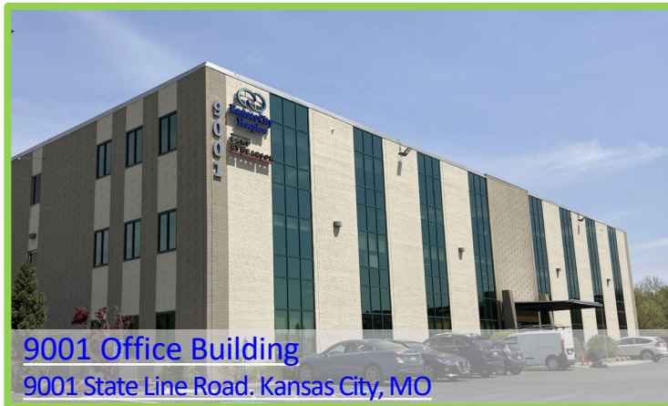
9001 Office Building 9001 State Line Road, Kansas City, MO