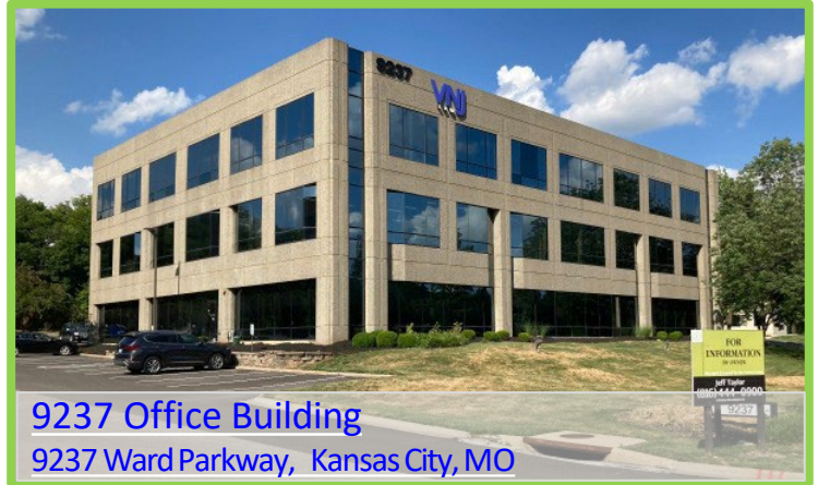
9237 Office Building 9237 Ward Parkway, Kansas City, MO