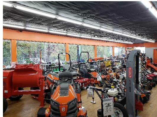
ABUNDANT NATURAL LIGHT

Tastefully remodeled, GC-zoned retail/commercial building with 40 pkg spaces is strategically located in the heart of Buellton directly across from the new Crossroads Shopping Center. This property is offered for sublease at $2.25 / s.f. ($11,800 / month) plus NNN, estimated at $0.35 cents / s.f. per month. Term length of lease is negotiable, but Lessor prefers a 4+-years initial term with additional options to Extend.