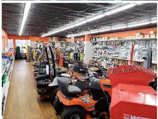
FLEXIBLE, OPEN FLOORPLAN

FOR SUBLEASE EXCEPTIONAL BUELLTON LOCATION Across from the Crossroads Shopping Center