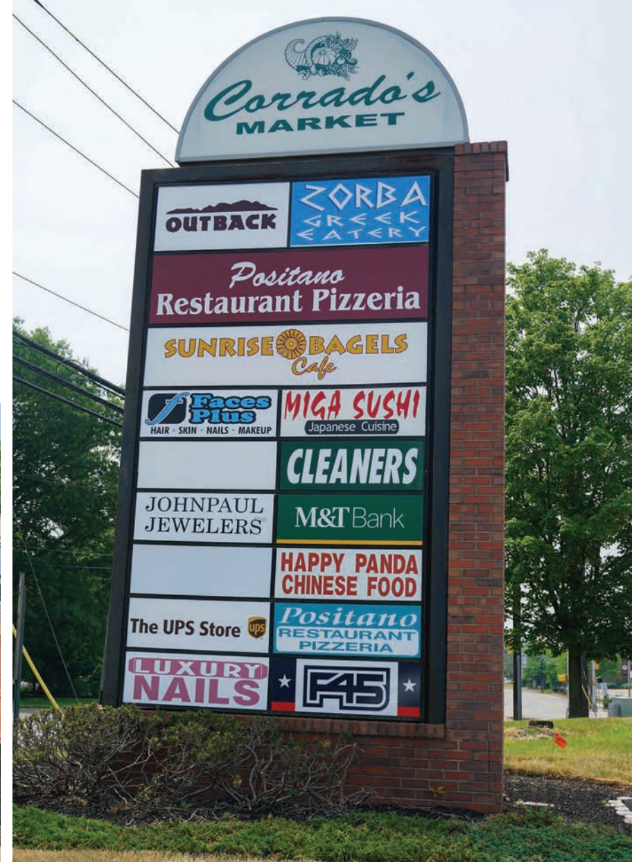
POINT VIEW SHOPPING CENTER WAYNE, NJ