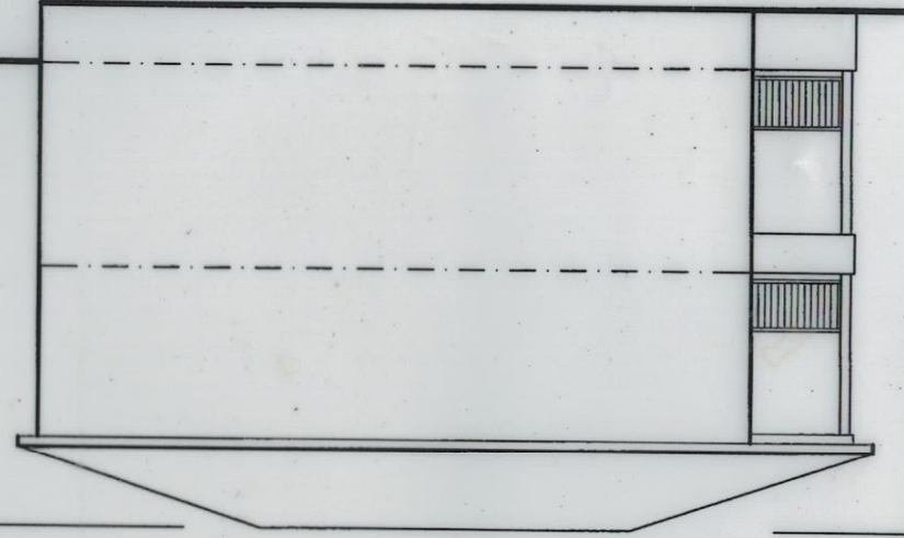
TYPICAL SIDE YARD ELEVATION

FIRST FLOOR SECOND FLOOR ROOF PEAK (APPROX)