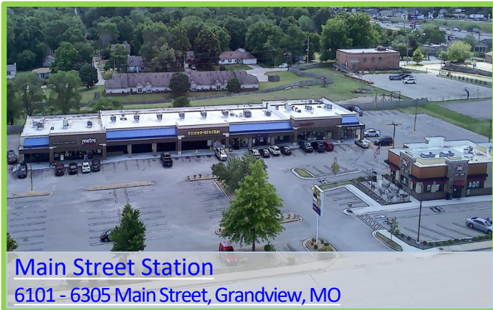
Main Street Station 6101 - 6305 Main Street, Grandview, MO