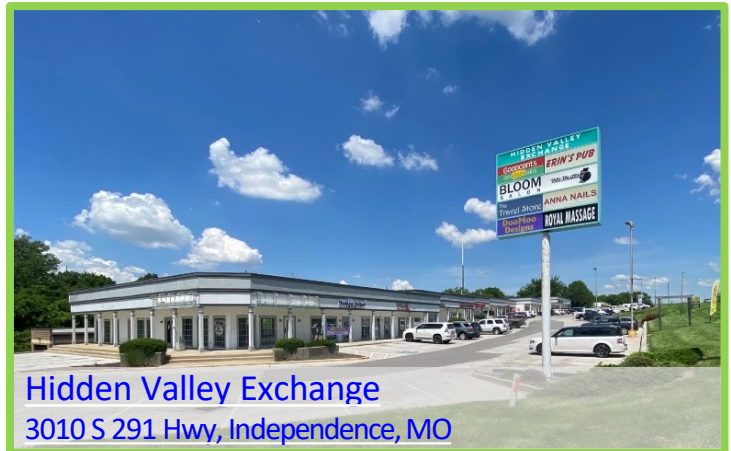
Hidden Valley Exchange 3010 S 291 Hwy, Independence, MO