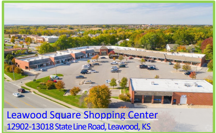
Leawood Square Shopping Center 12902-13018 State Line Road, Leawood, KS